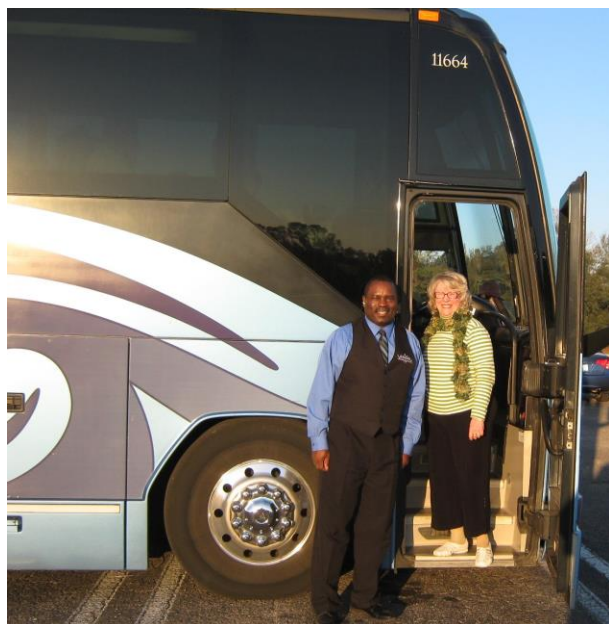
Leaving Gainesville at the crack of dawn